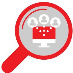
CredMonitor for Enterprise