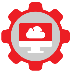
CredVerify™ REST API CredVerify™ Appliance

Between 15% and 40% of a typical company's credentials already exist in our database